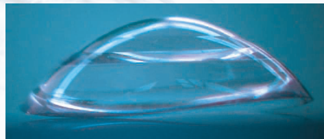
Available in a front surface toric for residual astigmatism